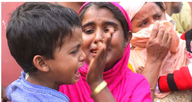
Women in Guwahati protest against the Assam government's crackdown on child marriage.

"I am worried about how I'm going to look after my child," an unidentified woman, carrying a three-month-old infant, told The Indian Express . "My husband worked as a farm labourer. I ran away from home to get married so I don't have any other support. As of now, I don't have a single rupee with me."